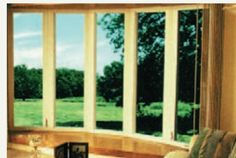
A beautiful BESTCAN Ultra-R 2000 Bow window adds space and light while providing a great outdoor view.

It keeps out 84% UV rays, which can fade and damage furnishings as well as pose a health hazard. It also deflects heat, keeping it out in the summer and inside in the winter, making their home more comfortable and cheaper to heat and cool.