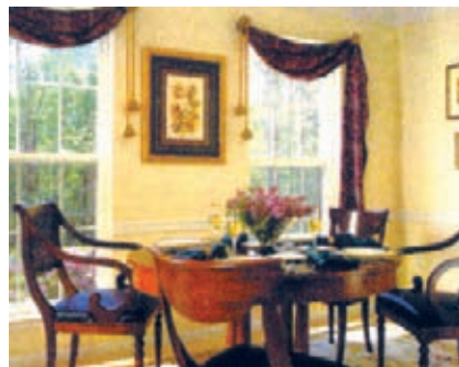
BESTCAN UltraR Double Hung window gives you new meaning to a traditional look. Designed for years of satisfying performance with eye catching appeal.