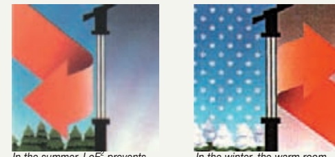
In the summer, LoE 2 prevents solar heat gain and reduces ultraviolet transmission.