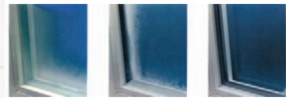
All metal spacer bars show excessive condensation even in the mildest winters.