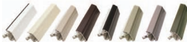
White / Cream / SDT / High Gloss Brown / Commercial Brown / Hickory / Sable / Grey Colours may not be exactly as shown.

Standard window colours include: White, Cream, SDT, High Gloss Brown, Commercial Brown, Hickory, Sable and Grey. Choose a standard or custom colour and we'll guarantee the finish for 15 years.